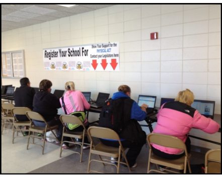
Registering for Let's Move Active Schools