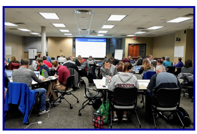
PE Workshop deeper dive into the benchmarks