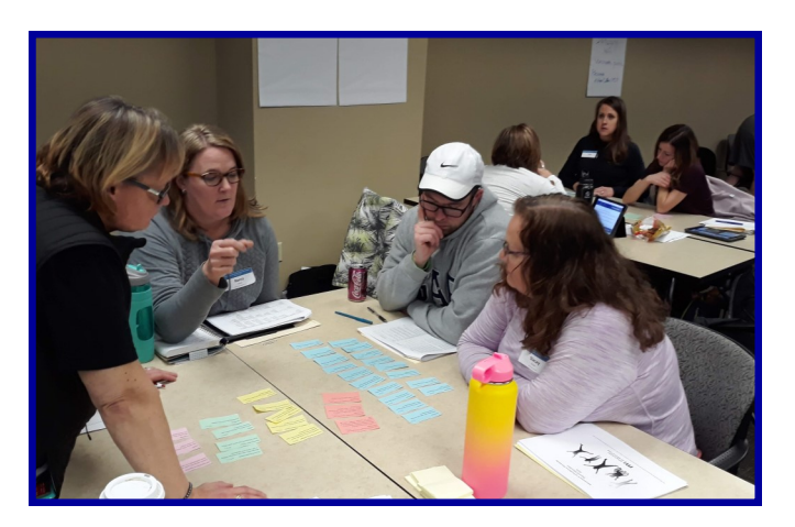
PE Workshop Bundling example