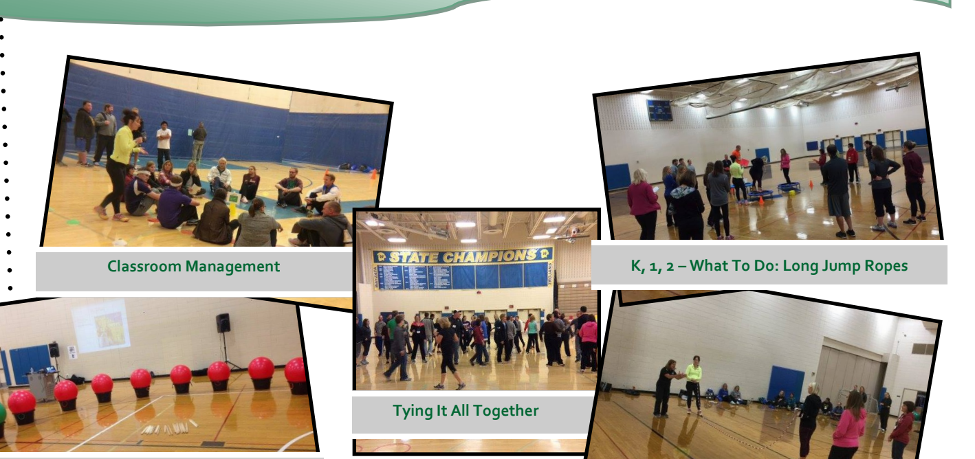
Let's Do A Drumming Unit in PE/DAPE